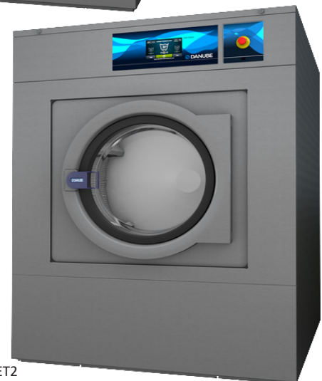
WEN 60 ET2