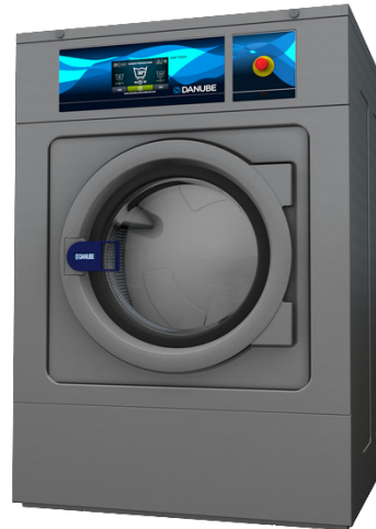
WEN 27 ET2